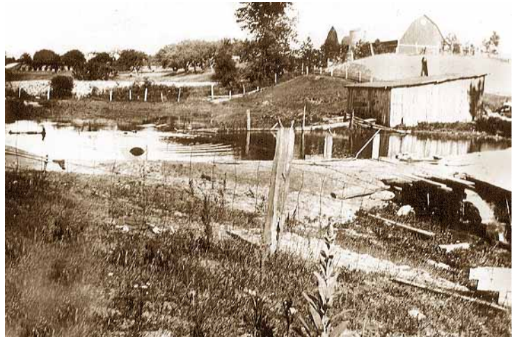
Pond on William W. Kline Farm Where Waterwheel Was Located