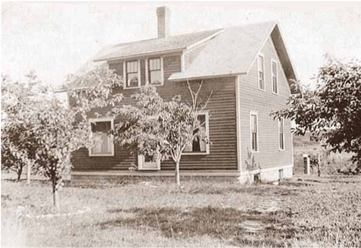
Early View of William W. Kline Centennial Farmhouse