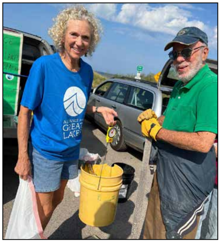
Beach Sweep Volunteers, see article on page 11.