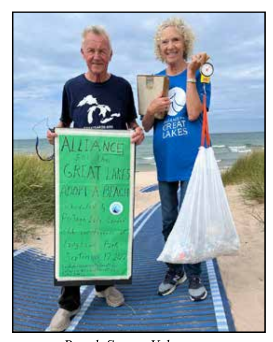
Beach Sweep Volunteers