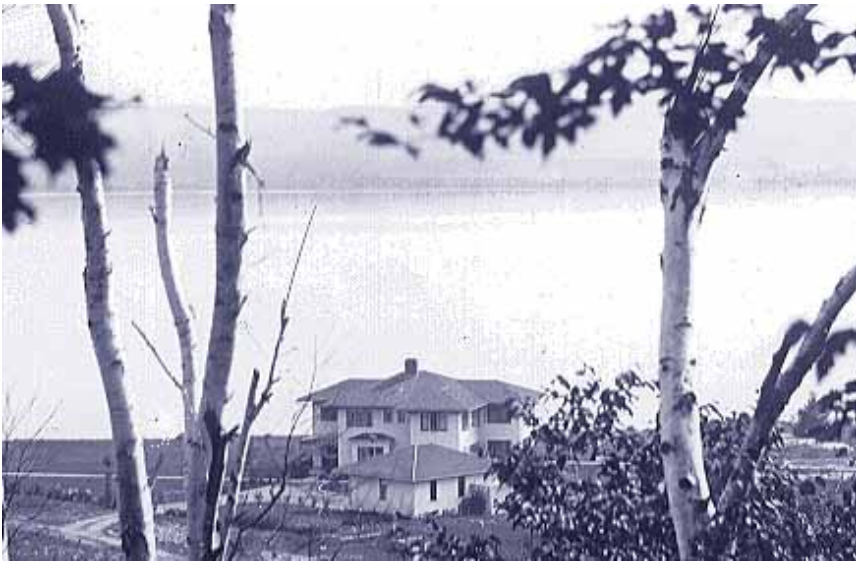
2092 Crescent Beach Road