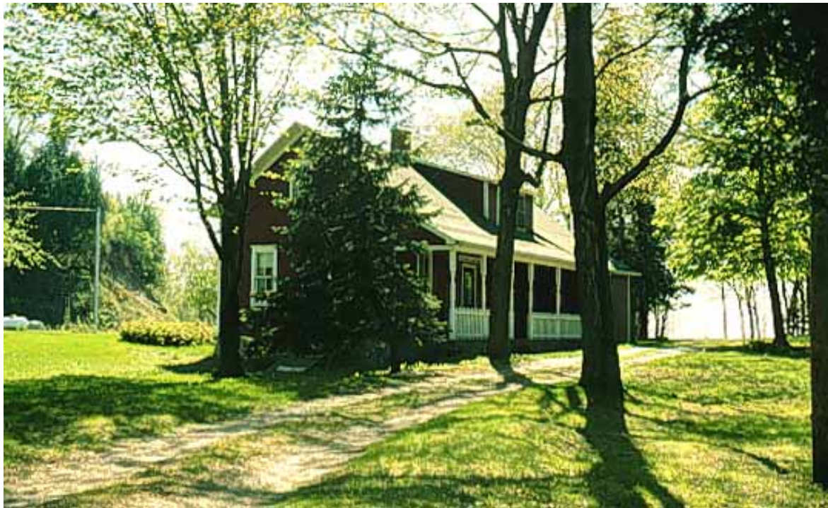
1963 Crescent Beach Road