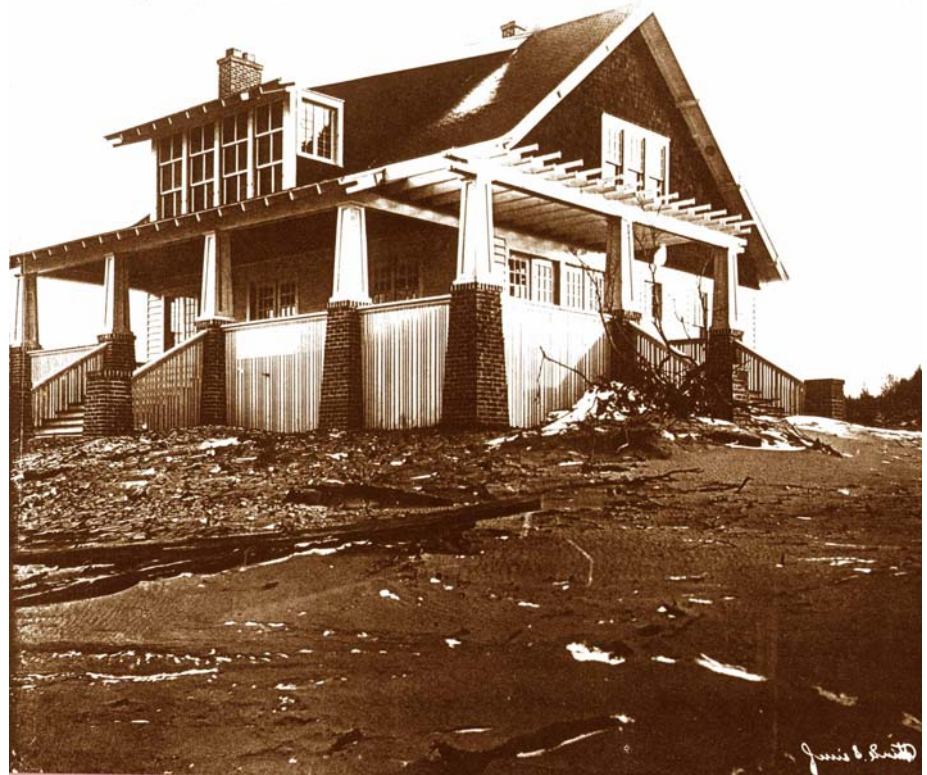
1980 Crescent Beach Road