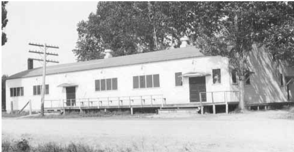
Early View of Current Fair Pavilion