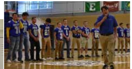
Above is the senior class on Blue & Gold day.