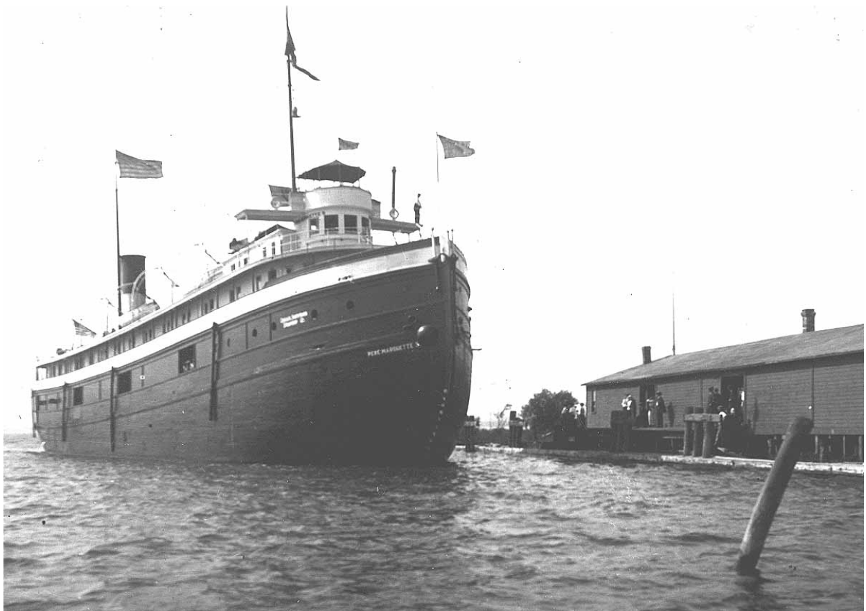
Pier Marquette 5 at Onekama Dock

In 1914, the Pere Marquette Freight Pier and Warehouse are shown on the insurance map as being at what is now the Park waterfront. When the Village purchased the land in 1934, it had been used by the Crerar Clinch Coal Company of Illinois and contained docks of the previous occupant, Northern Michigan Transportation Company. During 1939, WPA crews developed the Onekama Village Park. Renovations to portions of the Park in 1978 included the building of the bathhouse where the drive of the Park used to be when it formed a continuous loop from entrance to entrance.