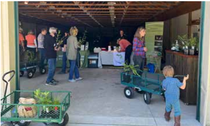
2nd Annual Native Plant Event

Who doesn't love fireworks? The show put on by the PLA during Onkama days is very popular and we appreciate all the donations we can get to help defray the cost. See the form at the end of the newsletter to make a donation. You can also go to Onkama.info and make an online donation. Thank you, your help is appreciated.