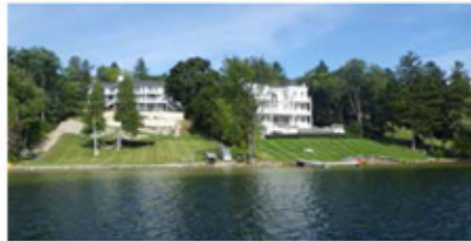
Manicured lawns and beaches are often the cause of degraded water quality.

Volunteers in the Score the Shore assessment use aerial maps and GPS to divide the shoreline of their lake into 1,000 foot sections. Volunteers