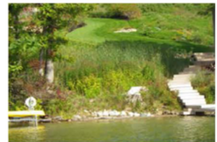
Lake residents can strike a balance between their needs and the lake's needs by keeping unmowed vegetation between the mowed lawn and the lake.

If you are interested in finding out more information about the Score the Shore program, please visit https://micorps.net/lake-monitoring/ .